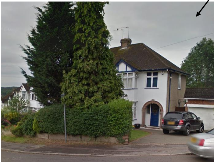
View from houses marked in red